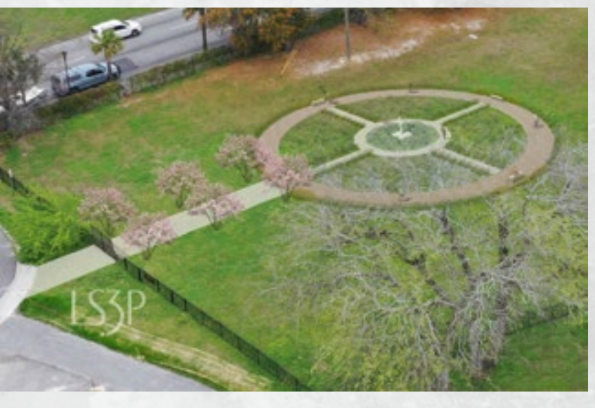
CONCEPTUAL DESIGN OF SAINT JOHN CEMETERY MEMORIAL PARK

The lay Catholic community of Charleston shares a duty to make this final resting place of our departed Catholic brothers and sisters a holy place of remembrance and prayer.