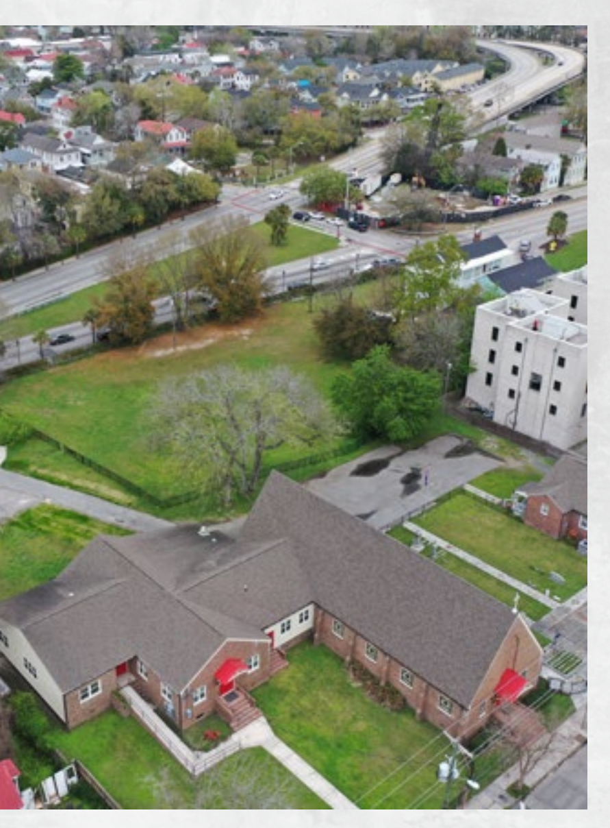
PRESENT DAY SAINT JOHN CEMETERY CHARLESTON, SC

property. It fenced in most of the land and posted a sign identifying it as a Catholic cemetery.